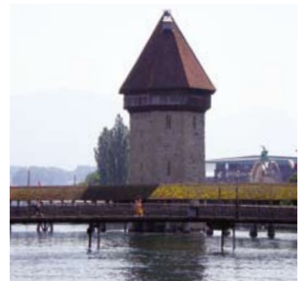
The Kappel bridge in Lucerne.