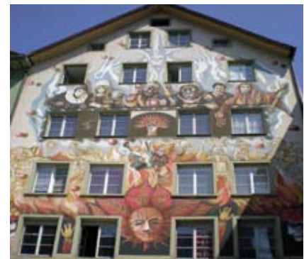
The Fritschi house in Lucerne.