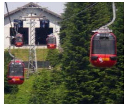
Gondola ride from Kriens to Fränküntegg.